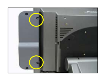
4. Secure the reader with screws (circ)