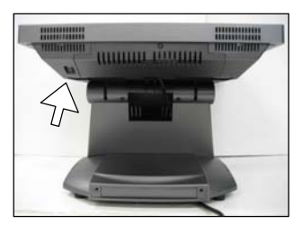
8. Press power switch to turn on.