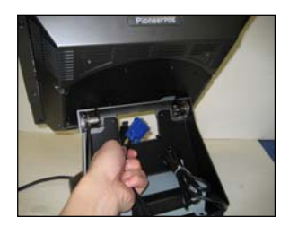
5. Route cables of peripherals to the front.