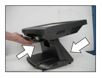
7. Place back the port's cover and Base cover (see arrows.)