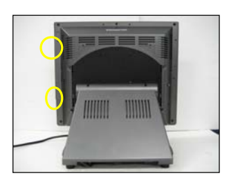
1. Remove screws (circles) to access ports for the reader(s)